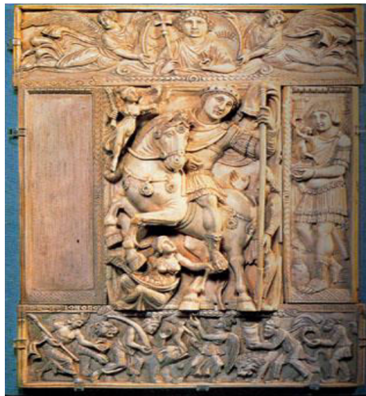
Ivory in the Louvre Museum