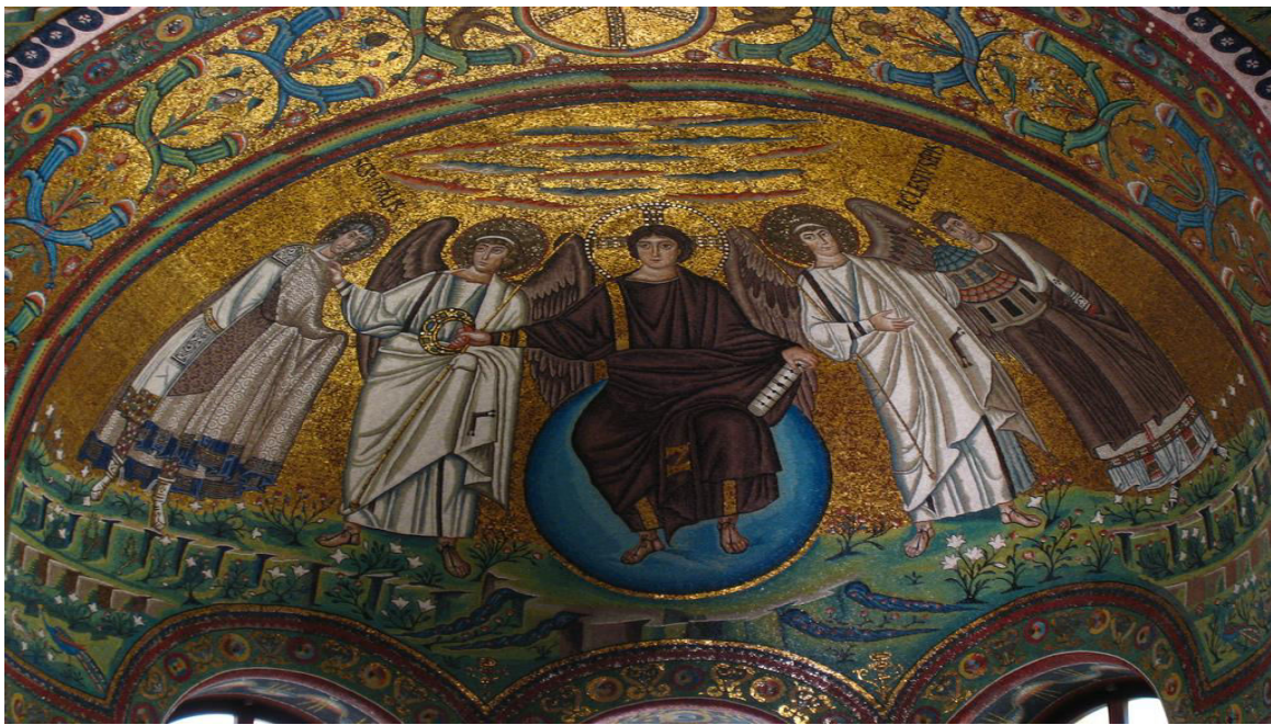
San Vitale Ravenna Italy Window Apse of Justinian